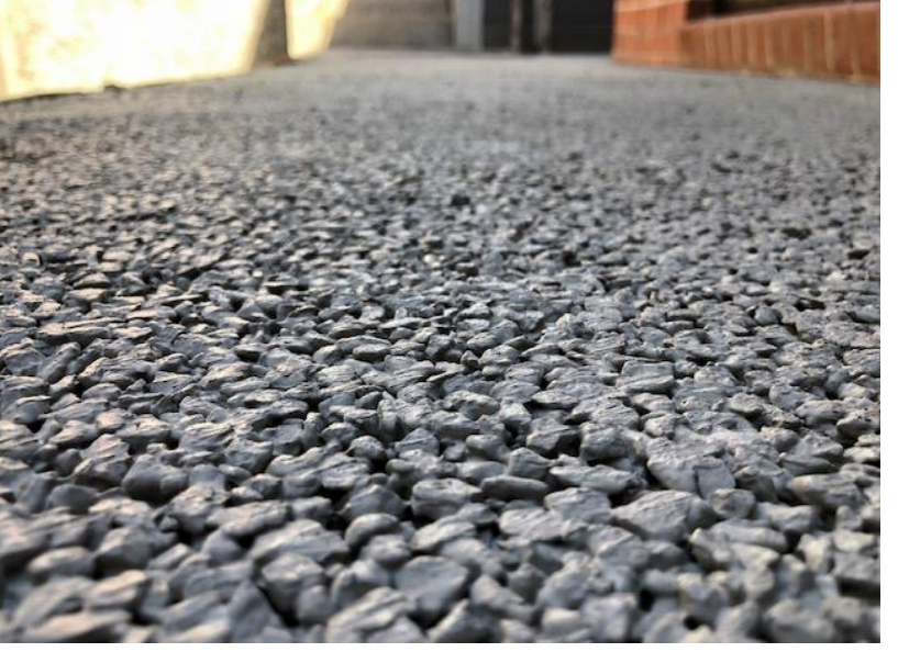
STONE CHARACTERISTICS OUTSIDE PHOTO RANGE MAY VARY

There are likely to be variations in consistency of colours and textures, appearance and quality in the finished product of the hardened concrete, as the raw ingredients are natural and subject to variations beyond our control. Whilst every effort has been made to match the colours in the preparation of this document, reproductive processes will alter the actual appearance in the concrete products to varying degrees.